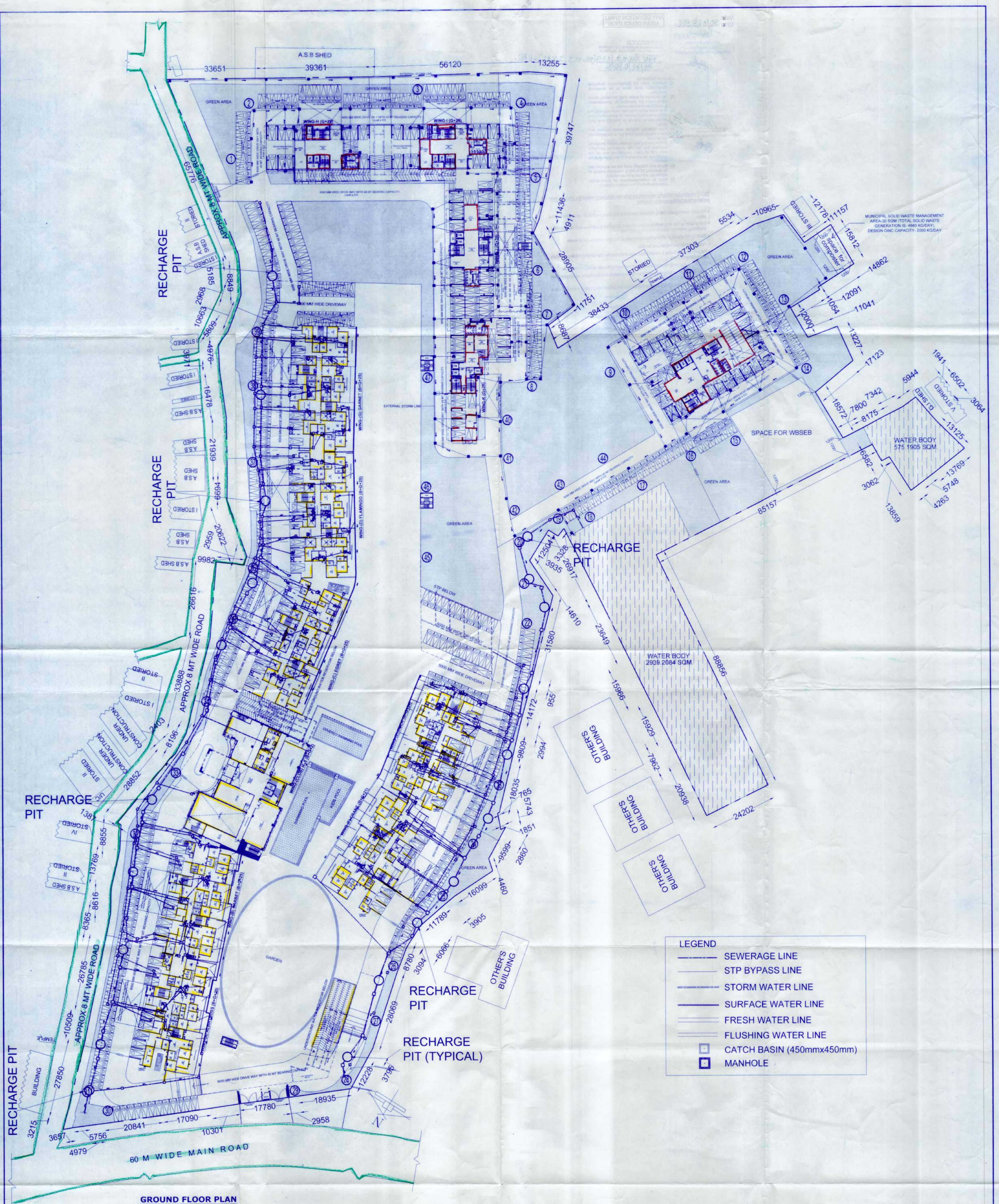
GROUND FLOOR PLAN SCALE-1:400